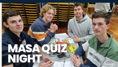
MASA QUIZ NIGHT