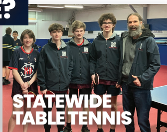
STATEWIDE TABLE TENNIS