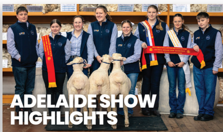
ADELAIDE SHOW HIGHLIGHTS